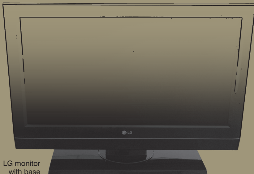
LG monitor with base