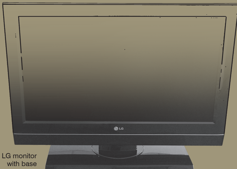
LG monitor with base